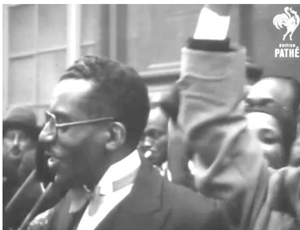
Figure 28 Noble Sissle and Tommy Ladnier