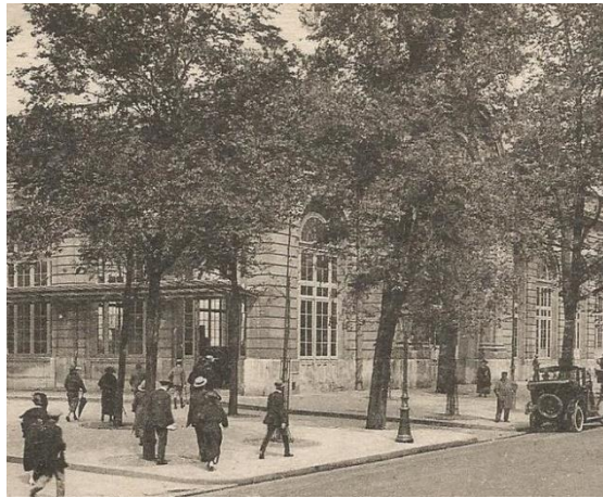
Figure 35 Gare des Invalides c 1930, south-east corner

The location shown in the last film scene is clearly shot overlooking Rue Robert Esnault Peltier as seen in the following comparison, where the characteristic portal on the building across the street can be recognized.