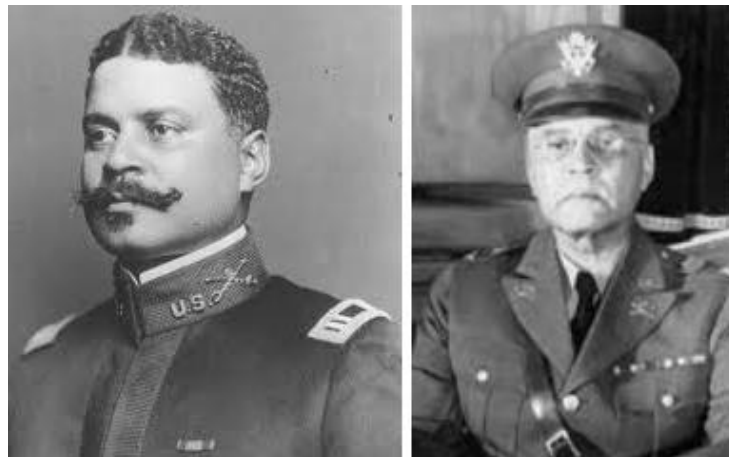
Figure 1 Benjamin O. Davis c. 1901 and in the 1940s

Davis also led two more African-American parties in 1931, arriving in Paris late in the evening of 7 June and 18 June respectively. He was later promoted to Brigadier general in 1940 and served in the Second World War.