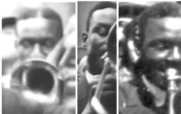
Figure 10 The second trombonist from the Invalides “Compton” still (right) and from the Pathé film clip

Therefore, only the rightmost trombonist remains to identify. He is tall or at least over medium height, his complexion is rather dark and his mouthpiece is placed slightly off-center to his right side. His grip on the slide and his hand movements are somewhat strange as can be best seen in the video. His palm is angled almost 90 degrees to his arm – most trombonists have the palm more or less as a prolongation of the arm.