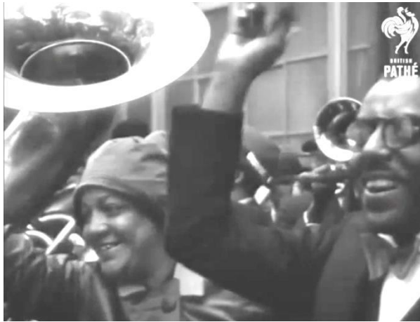
Figure 27 Bricktop and Noble Sissle