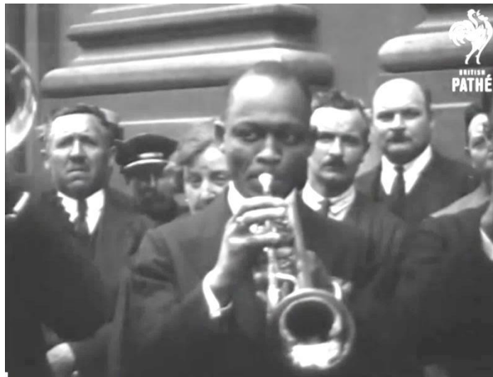
Figure 32 Tommy Ladnier