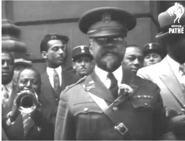
Figure 30 Gene Bullard; Cricket Smith; US Colonel Benjamin O. Davis; Unknown