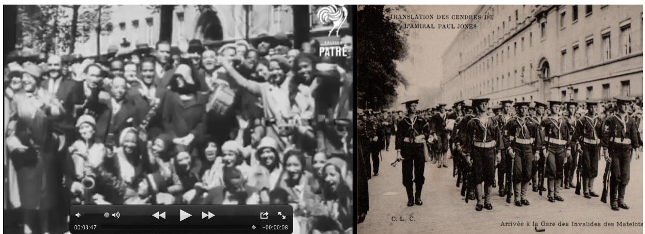
Figure 36 Farwell film clip scene compared to contemporary photo.

The location shown in the last film scene is clearly shot overlooking Rue Robert Esnault Peltier as seen in the following comparison, where the characteristic portal on the building across the street can be recognized.