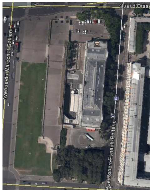
Figure 34 Gare des Invalides today

Gare des Invalides is a big building near the Seine at the corner of Quai d'Orsay and Avenue de Maréchal Gallieni. However, the entrance was on the south side from Rue Robert Esnault Peltier. The first part of the film was shot on the south side of the building and near the entrance at the south-west corner. The farewell gathering with people waving at the end of the film clip was shot at the south-east corner, facing the buildings across Rue Robert Esnault Peltier.